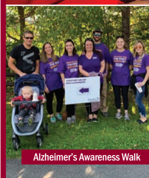
Alzheimer's Awareness Walk