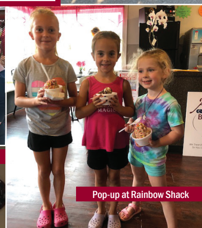
Pop-up at Rainbow Shack