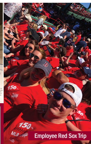
Employee Red Sox Trip