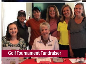
Golf Tournament Fundraiser