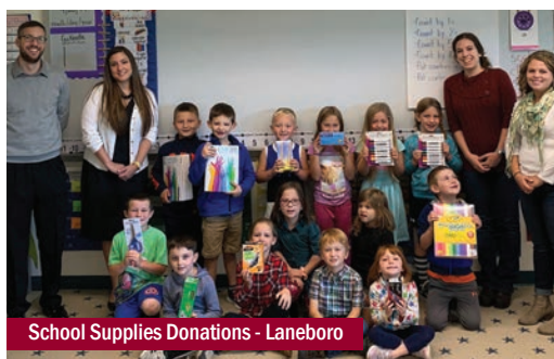
School Supplies Donations - Laneboro

One of our main objectives in the planning of our 150th year was to find ways to celebrate, in turn giving thanks to the reasons for our success - our customers, communities, and employees. What a tremendous and busy 2019!