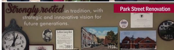
Park Street Renovation