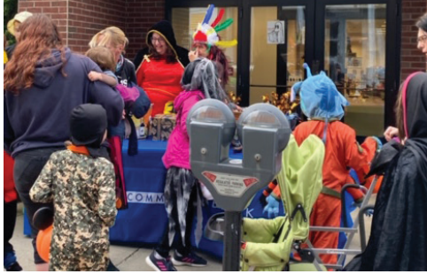
The North Adams team participating in the NBCC's trick-or-treating event.

Congratulations to our North Adams branch for being awarded the community recognition award, Neighborlies , by the Northern Berkshire Community Coalition (NBCC). Members of the North Adams branch were on hand at a recent awards ceremony held at MCLA to accept the award in the "Business & Groups Pulling Together" category. The team was recognized for their outstanding show of participation in the NBCC's Trick or Treat event held in late October, handing out somewhere between 500-600 pieces of candy and goodies to the local children.