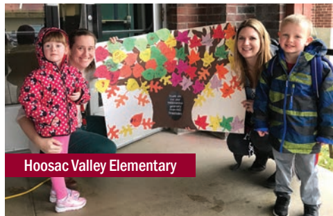
Hoosac Valley Elementary

We appreciate the "thank you's" that we received from the schools, including the homemade card above from Hoosac Valley Elementary.