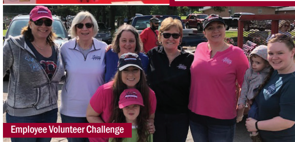
Employee Volunteer Challenge